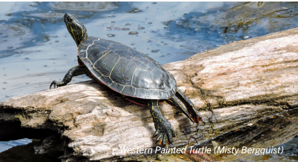
Western Painted Turtle (Misty Bergquist)

Drones disturb wildlife; they are not permitted on the wharf or along the foreshore trails.