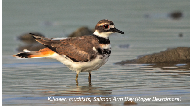
Killdeer, mudflats, Salmon Arm Bay (Roger Beardmore)

Never leave fishing line, weights, or other tackle in the water or anywhere birds or other wildlife could be injured.