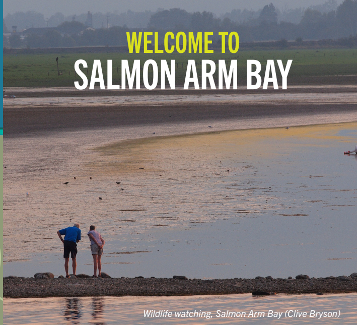
Wildlife watching, Salmon Arm Bay (Clive Bryson)