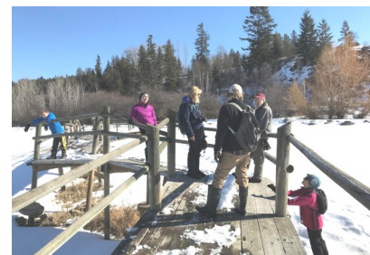
Restoring the Bird Tower

The Hummocks are greening up. Keep an eye out for flowering shrubs over the next weeks. Our goal of creating greater diversity and enriching the habitat is becoming a reality. There have been reports of deer, weasels, pheasants, geese and aquatic invertebrates to name a few. Unfortunately, we lost some trees and shrubs, first to high water and then to the extended drought. Kim Fulton and