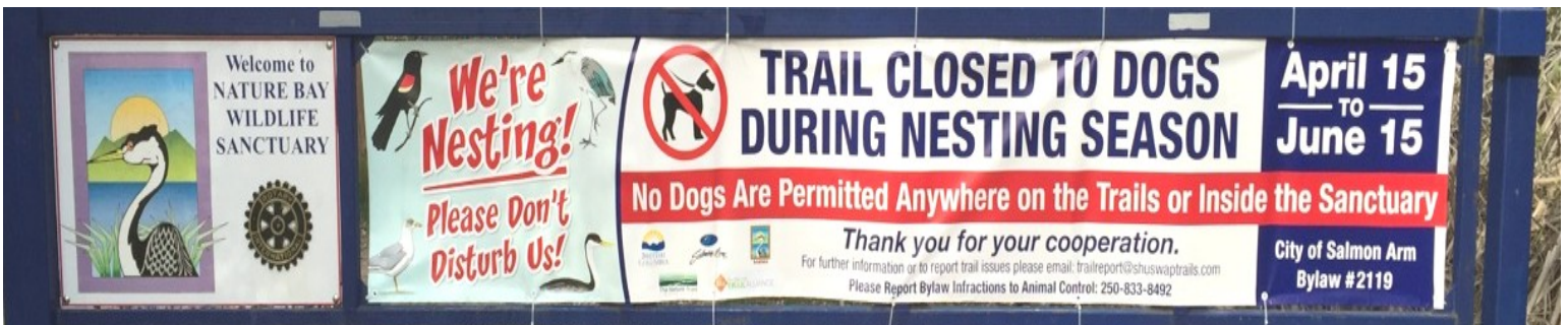
Nesting Season Banner Apr 15—Jun 15 on the Main Gate to the Foreshore Trail

The foreshore trail is closed to dogs during the critical nesting period between April 15 and June 15 ; there is no dog access off the foreshore trail onto the boardwalks or Christmas Island at any time, and removal of dog waste is required. Monitoring of trail users and compliance with dog control will continue on the foreshore this Summer. Trail users are asked to continue to report all disturbances or bylaw infractions by emailing trailreport@shuswaptrails.com ( Attach photos if available.) Also call the animal control hotline at 250-833-8492 . We have had reports of dogs roaming freely around the Osprey tower at the end of the spit of land close to the wharf( the Kime Trail). We request that these instances be likewise reported. Please show respect at all times to fellow trail users and compliment those dog-walkers who are respecting the by-laws.