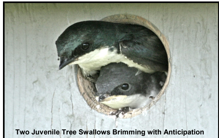
Two Juvenile Tree Swallows Brimming with Anticipation

enhances their population is valuable. We are thrilled for the birds and will continue this undertaking for as long as the birds respond.