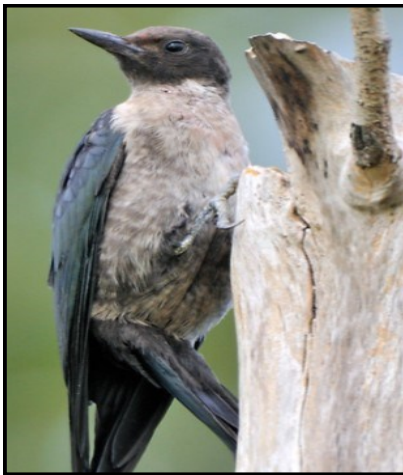
Lewis's Woodpecker (juvenile)