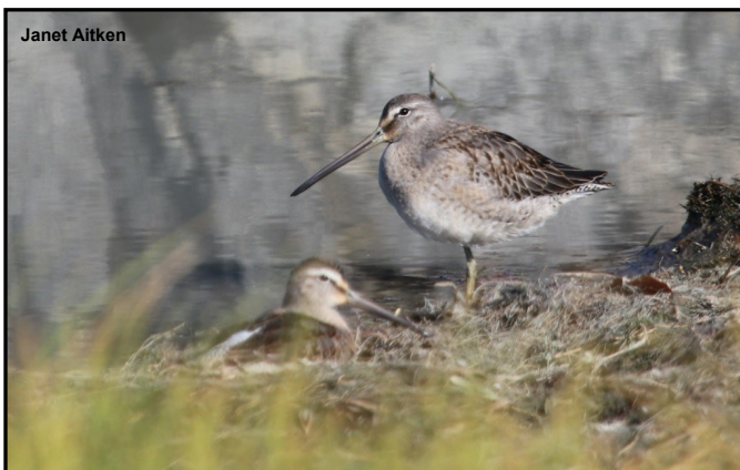
Long-billed Dowitchers on Christmas Island