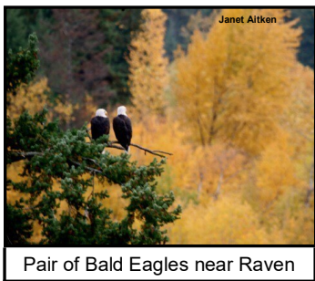
Pair of Bald Eagles near Raven