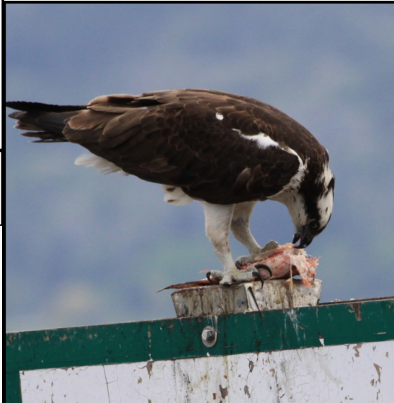
Clockwise Above—Osprey enjoying a salmon at the wharf, Tree Swallows along the Foreshore Trail, Ring-billed Gulls nesting on Christmas Island