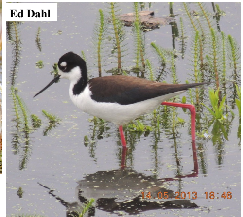
Black-necked Stilt

By Saturday May 18 th , there were a few Western Grebes within the open water behind the Prestige , some of which were dancing. I took that as a good sign and expect a lot of the Grebes will soon be building nests there. That area seems to offer some protection from north winds as long as lake levels do not get too high (as was the case last year). The Shuswap Lake water level in 2012 was 90 cm. (30") higher than the 5 year average high water level and very close to the high water levels of 1972 , 40 years earlier.