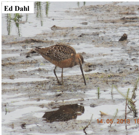
Long-billed Dowitcher (PJ Park)

One week later on May 14 th , it was calm, cloudy and 12 degrees and lake levels were rising. We counted 157 Western Grebes, 53 just east of the Nature Centre and 18 west of the Prestige Inn along the the grass. At Peter Jannink Park the grass adjacent to the path had shallow water where 2 Black-necked Stilts were feeding along with a few Long-billed Dowitchers and a Least Sandpiper , all resplendent in their spring colours.