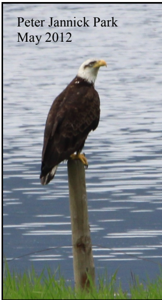
Peter Jannick Park May 2012

I often fish from my boat on Shuswap Lake, going along close to the shore by Murdoch Point, across the bay from Sicamous. I fish very slowly, about 1km per hour, usually trolling a fly. The Bald Eagles watch the anglers along there, and if the rainbow trout is a jumper, the eagle will fly down and try to snatch it off the line. Early in the Spring the eagles are very hungry and will fly along from tree to tree to keep a close watch. Last year as I was reeling in a trout I heard a whooshing sound and looked up to see an eagle coming straight at me as I was lifting the fish into the boat. I leaned back quickly and the eagle missed me and the fish and settled in a nearby tree. I released the trout and slipped it over the side. Without hesitation the eagle swooped down in a power dive, wings up, hit the water, spraying me, and took off with the trout.