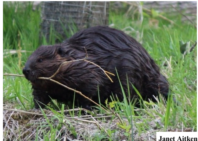
One of our resident Beavers