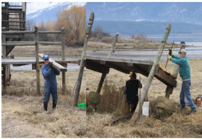
Ed Dahl, Gary Lomax and Mike Saul shown (above) remove the sections of cap-sized walkway and (below) secure the useable timber together with the donated poles.

I often fish from my boat on Shuswap Lake, going along close to the shore by Murdoch Point, across the bay from Sicamous. I fish very slowly, about 1km per hour, usually trolling a fly. The Bald Eagles watch the anglers along there, and if the rainbow trout is a jumper, the eagle will fly down and try to snatch it off the line. Early in the Spring the eagles are very hungry and will fly along from tree to tree to keep a close watch. Last year as I was reeling in a trout I heard a whooshing sound and looked up to see an eagle coming straight at me as I was lifting the fish into the boat. I leaned back quickly and the eagle missed me and the fish and settled in a nearby tree. I released the trout and slipped it over the side. Without hesitation the eagle swooped down in a power dive, wings up, hit the water, spraying me, and took off with the trout.