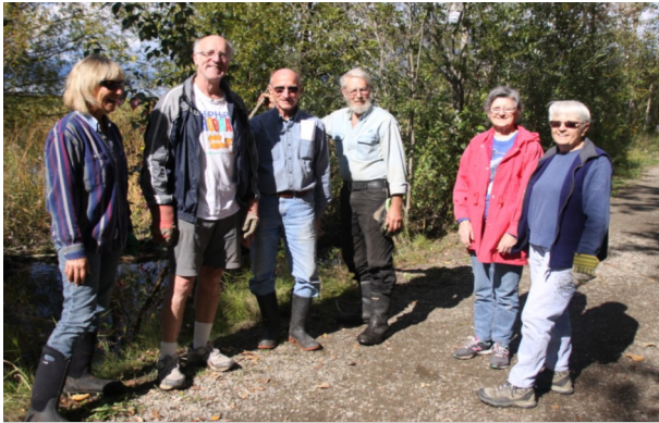
Volunteers pause from installing wire around trees near the latest Beaver Dam

Our Board Members are constantly monitoring the trail, fixing boards, trimming trees, installing signs or putting wire on the trees to save them from the beavers. The main foreshore trail is carefully maintained by our steward volunteers who have each assumed responsibility for caring for a section of the trail. Rotary and Steve Genn in particular have helped us with materials, heavy equipment and manpower to rebuild the walkway going out to the bird tower. Thanks also to Ken at G.I.D. Contracting for the donation of signage poles.