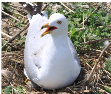
Ring-billed Gull on Christmas I.

Plover seldom seen here. The new species were a Whimbrel , photographed flying at the end of the wharf on June 6, and a Ruff , seen by several birders on August 14, as it fed near the wharf. The rare visitor was a juvenile Pacific Golden Plover seen for several days from September 22 feeding between the mouth of the Salmon River and Christmas Island.