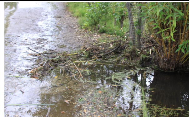
↑ Beavers are trying to dam a stream on the rail side of the main trail near the biffy. ↓ Amounts of material collected are vast.