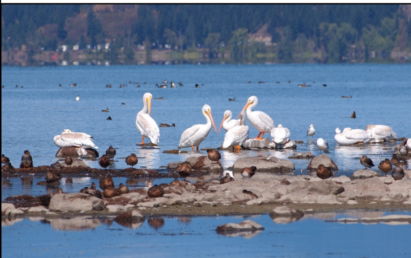
Pelicans on Christmas Island. Taken by Clive Bryson on Sept 4th, 2015