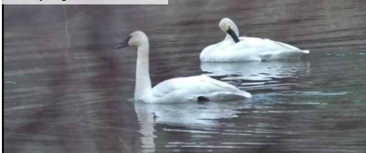
Trumpeter Swans on White Lake. Taken on Dec14,2017