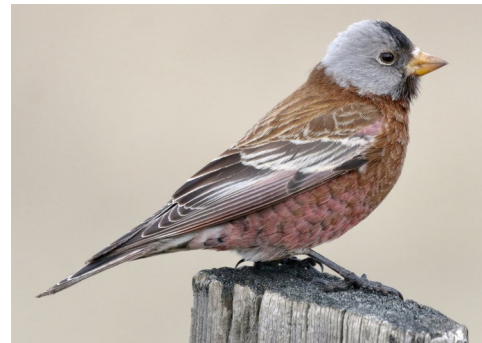
Gray-crowned Rosy-Finch This songbird is exceptionally hardy. It usually nests in the highest mountains in North America. The one seen near Salmon Arm seems to have had a GPS issue!

- Four long-eared owls were seen in trees near the Salmon River on November 6. Because they hide themselves in bushy habitat, these shy slender owls are likely present more often than realized. Western grebes successfully nested again, although numbers were down. They raised about 125 young to maturity. One Clark's grebe mated with a western grebe and had young. A dozen American white pelicans arrived in mid April. Their numbers varied over the summer but at one point there were about 100. Although it's doubtful that they nest in this area, their