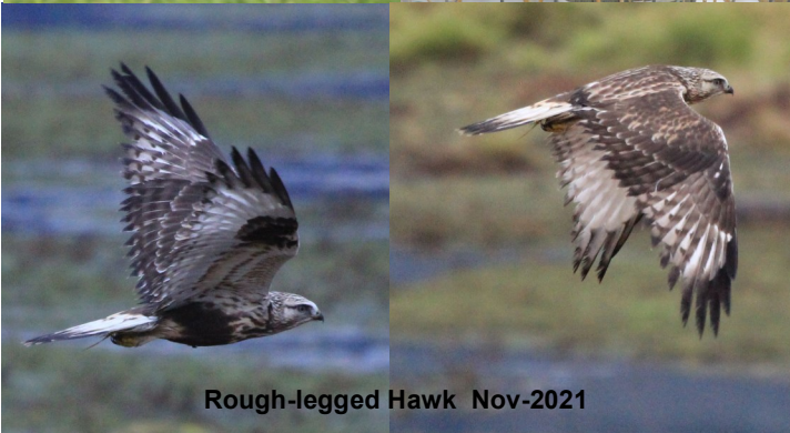
Rough-legged Hawk Nov-2021