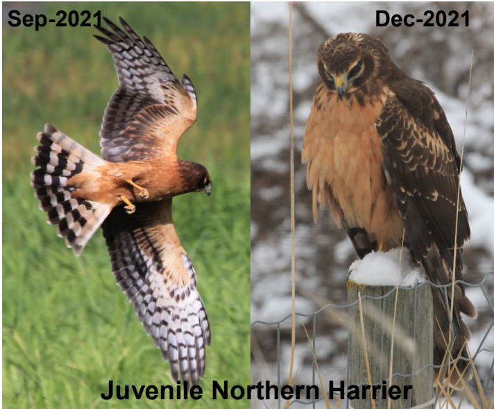
Juvenile Northern Harrier