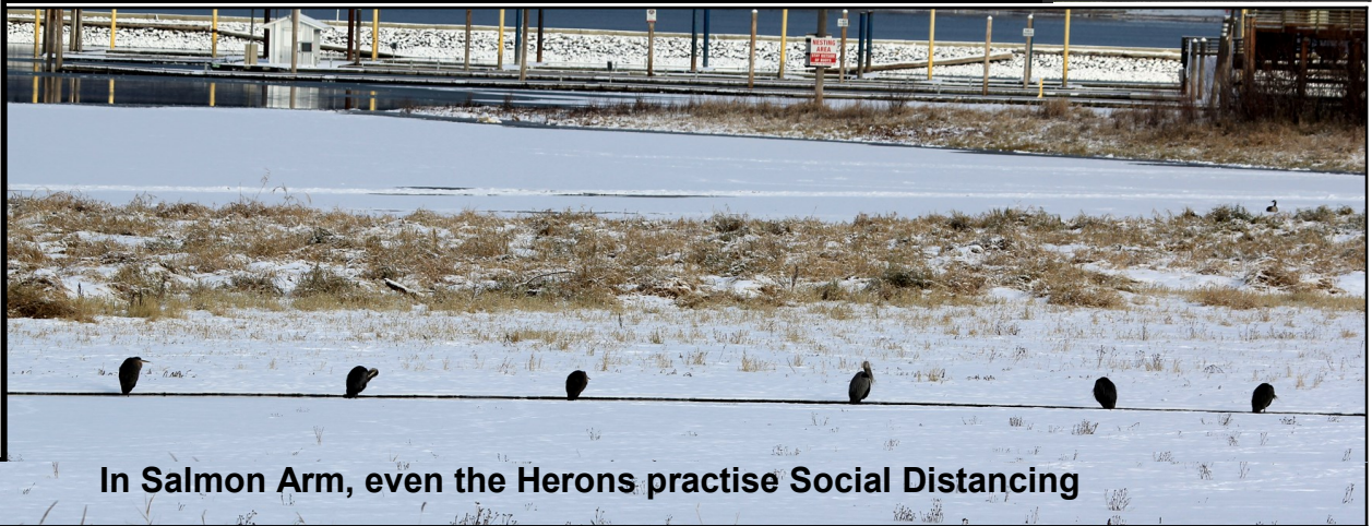
In Salmon Arm, even the Herons practise Social Distancing