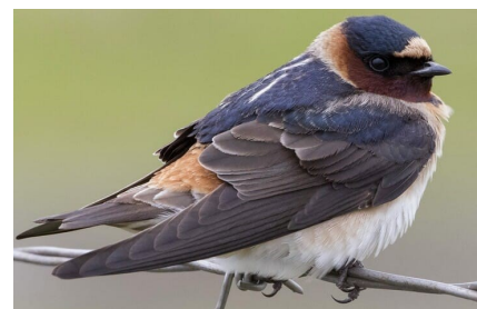
Cliff Swallow. Typically will build its nest from mud collected using its beak.

billed gulls. Once again, over 500 nesting pairs raised over a 1000 young. Among them were a pair or two of nesting short-billed (mew) and herring gulls. Two pairs of bald eagles , nesting on the south side of the Bay, successfully raised five young. Not so successful were the osprey. No nests occupied the wharf area. A pair spent all summer building a nest on Lakeshore Road near the Credit Union but don't appear to have laid eggs – perhaps next year, if the Canada geese don't get there first. The swallows also did not fare well. Vandals destroyed most of the nesting boxes along the Foreshore Nature Trail in April and May, including both eggs and birds. Even after