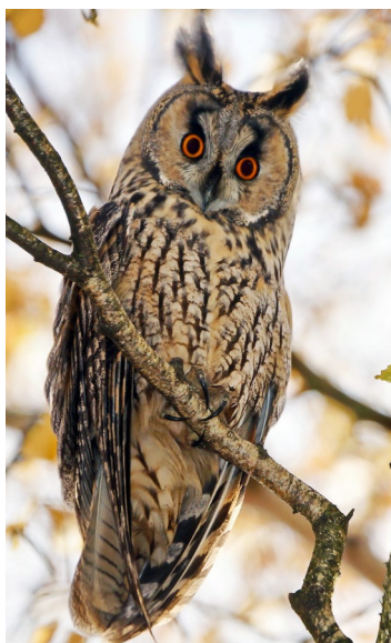
Long-eared Owl. This nocturnal bird has the ability to fly silently and enjoys a diet of small critters such as mice and voles.

seen on the Coast, was seen feeding on the mudflats. - On October 24 a couple of gray-crowned rosy-finches appeared in Peter Jannick Nature Park . These mountain finches may have come to the valley bottom because of inclement weather higher up.