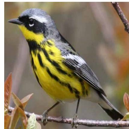
Magnolia Warbler. Males court females with song and show off the white spots on their tails.

Although no new species have been added to our checklist, several rarities are noteworthy: - On August 6 a magnolia warbler was spotted on the spit alongside the wharf. This small migratory bird is easy to miss as it feeds in thick bushy areas. - In the same general area on August 14 a ruddy turnstone , more commonly