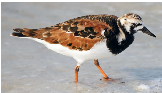
Ruddy Turnstone. So-named because they often flip over stones to get at prey living underneath .

Birders around Salmon Arm Bay have found it to be an average year. A total of 198 species have been recorded since January 1, including 38 species of waterfowl, 26 species of shore birds and seven species of gulls, all with a slightly higher count than last year.