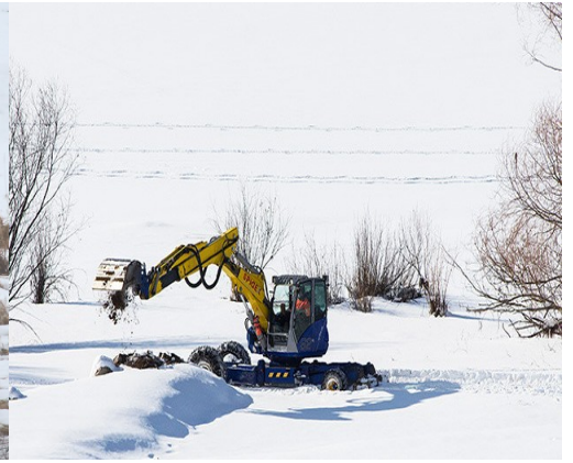
Meanwhile, at the Raven end of the trail, the versatile SPIDEX machine was creating the four hummocks.