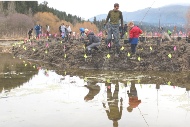
Here are one of the many young students who planned the layout of the plantings using coloured pins to indicate where to plant each species.