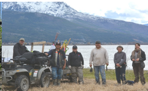
The myriads of tasks having been completed, the last day's crew prepares to depart after a job well done!