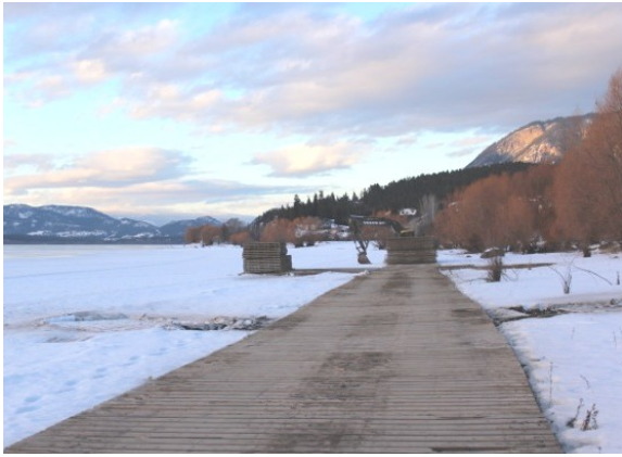
In order to protect the wetlands surface, the City laid swamp mats to carry the heavy equipment needed to repair the sewer line.