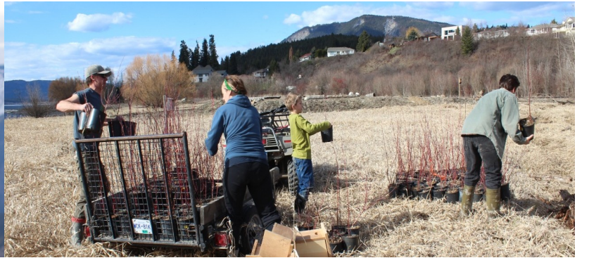
Tree saplings were transported and placed near to the hummocks for planting. Fortunately on this day the weather cooperated. There were 3,600 trees planted, including willow, black cottonwood, dogwood and prickly rose.