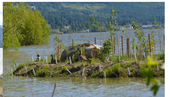
The hummocks have survived the pounding of waves during the storm of May 23 rd and now exist as a string of micro-islets in the bay.