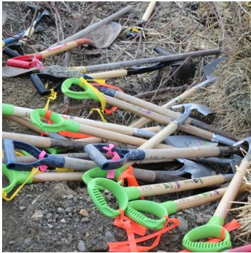
The planning of the planting activities was detailed and thorough.