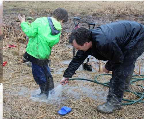
The plantings were done in mainly adverse weather conditions by students, scouts and others and directed by skilled supervisors.