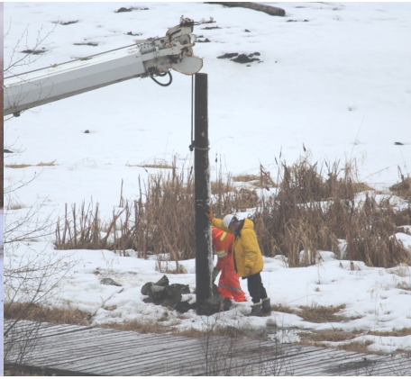
Taking advantage of the accessibility afforded by the swamp mats, SABNES installed poles for bird and bat boxes.