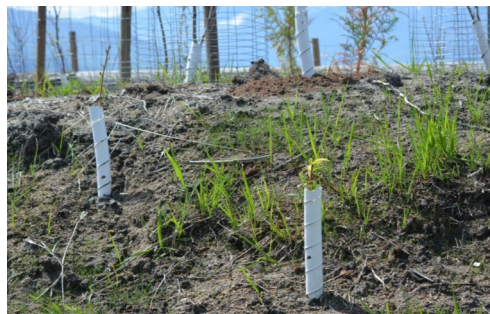
Spring growth is now evident. The fencing around the trees is to protect them from voles and other predators.