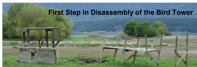
First Step in Disassembly of the Bird Tower

Permission Granted: The City of Salmon Arm will begin an upgrade of the wettest part of trail this fall. SABNES was able to secure permission for this from FLNRO (BC Ministry of Forest Lands, Natural Resource Operations). We were also granted permission to rebuild the bird viewing platform. Work will begin in August.