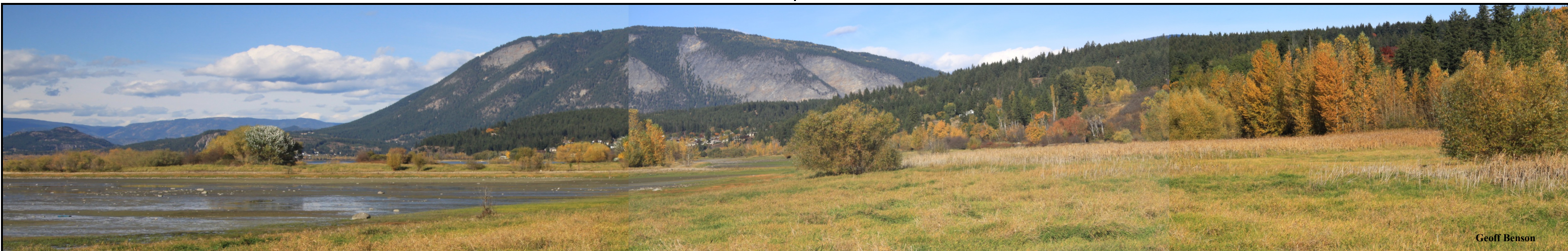
Panoramic View of Nature Bay from the Foreshore - Taken on Oct 17 th , 2012