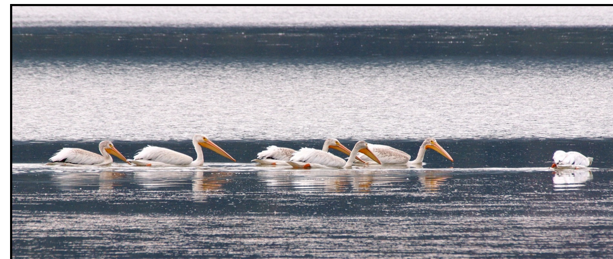
Pelicans off Christmas Island - Taken by Clive Bryson on Sept 29

The bird-tower boardwalk sustained considerable damage due to prolonged high water levels this year and is no longer usable in its present state. Only last year SABNES spent around $3,000 to replace planks and make height adjustments. SABNES directors are of the view that we should convert the boardwalk into a bird sanctuary. They propose that the horizontal approach section be removed in its entirety and the newer wood used in maintaining other boardwalks. The bird-tower would thereby be isolated and from then on be "strictly for the birds".