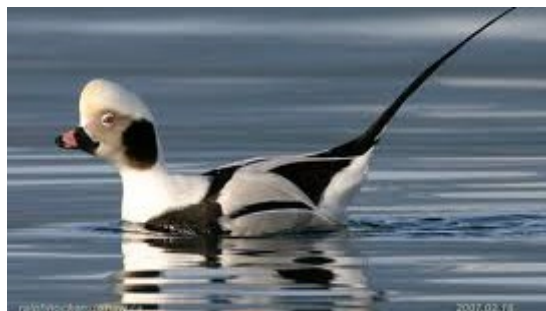
Male Long-tailed Duck

My last highlights of the year were the four Long-Tailed Ducks which were swimming close to the breakwater at the end of the wharf on October 7. There were three males and one female in fresh winter plumage—quite spectacular! These are sea ducks that nest in the tundra and are seldom seen here. It was a thrill seeing them and showing them to some of our Thanksgiving visitors.