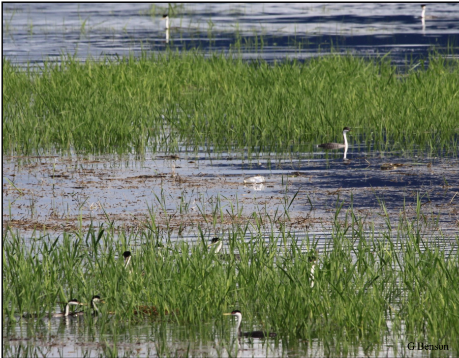
Grebes on the West side of the Prestige walkway– taken on June 28th,2011